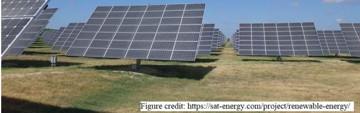
Figure C.4: Example of a dual-axis tracking array. Each unit is motorized rotating East to West through the day, and adjusting their angle of Southward tilt through the seasons of the year, always following the sun, and optimizing the solar energy production annually.

An example is shown in Figure C.4; dual-axis tracking follows the sun better than single-axis tracking but has more complicated shading issues at various times of the day and year. Each of these larger installations may require more robust footings or foundations that may be less appropriate for sustained agricultural or horticultural production.