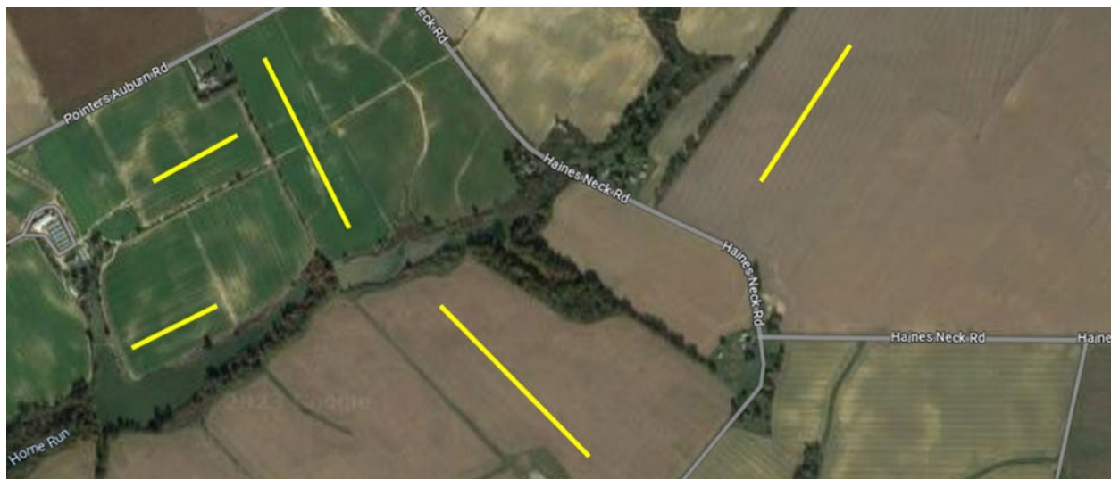
Figure C.5: Google satellite view of an area of New Jersey farmland showing the several different row alignments (yellow lines) that farmers have chosen for their work. None of these alignments coincide with the North-South direction.

As noted above, array and row crop orientation may impact both the agricultural or horticultural and solar aspects of a project. For reference, the Google satellite image in Figure C.5 shows an example of various row orientations that have been chosen by farmers for their operations. As noted above, the Dual-Use Solar Energy Pilot Program has a strong preference for installations that provide for diverse future farming land use so proposals for different row orientations are acceptable to the Pilot Program.