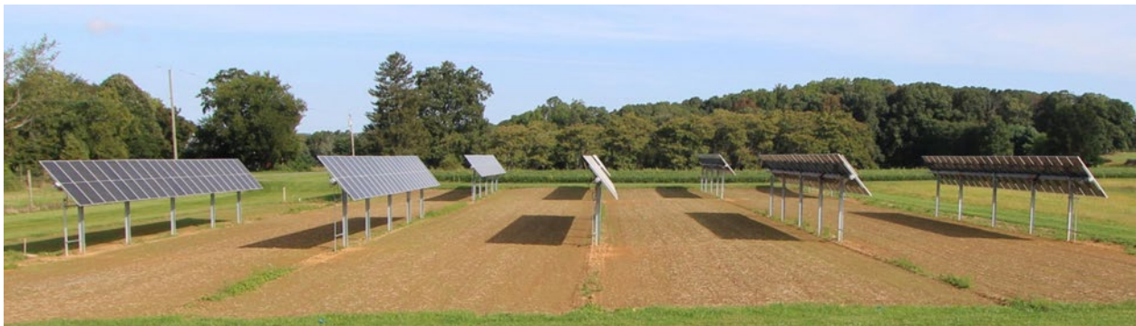
Figure C.2: Single-axis tracking solar array at Rutgers University's Snyder Research Farm, Pittstown, NJ. This array is built in rows that run typically North-to-South and are actuated by motors through the day to point more directly at the sun. Starting in 2023, agricultural research has commenced at this site funded by the US Department of Energy under the FARMS program and with support from the New Jersey Agricultural Experiment Station.

An example is shown in Figure C.2; single-axis tracking arrays are designed so that they aim the solar modules more directly at the sun through the progression of the day. This installation has individual motors on each row that control the tracking motion but many other designs are commercially available.