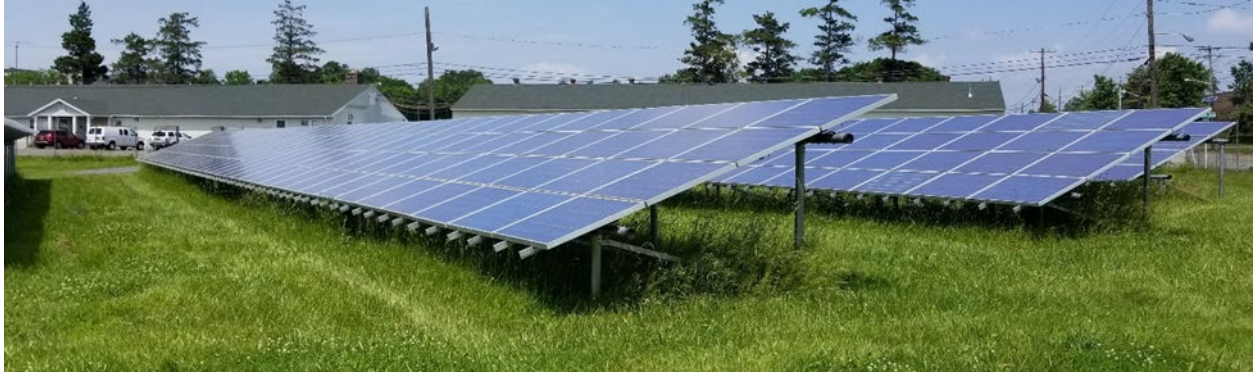
Figure C.1: Fixed-tilt solar array on Rutgers University campus, New Brunswick, NJ. This array is built in rows that run East-to-West and are tilted at a fixed angle. No agricultural operations are conducted at this site.