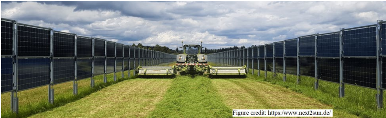
Figure C.3: A vertical bifacial array highlighting farm usage considerations. There is no limitation to the equipment headroom resulting in excellent ability to farm for all types of crops as well as grazing animals.